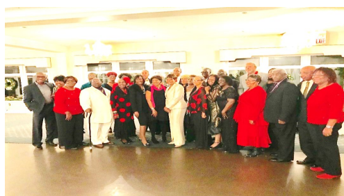
December 2017—Classmates at Christmas Celebration at Spring Valley Country Club